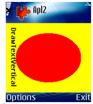
Fig. 7 Using graphics on Symbian phone

Usually this code is called from the Draw function, called when the screen needs to be painted.