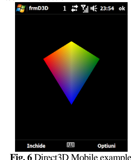
Fig. 6 Direct3D Mobile example

screen running the Direct3D Mobile code presented in this section.